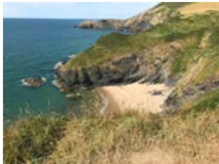
The scenery around Llangrannog (above) and Bont Goch (below) that inspired the novel.